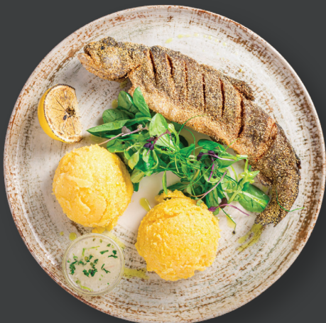
CORNMEAL-COATED FRIED TROUT** with polenta and garlic sauce