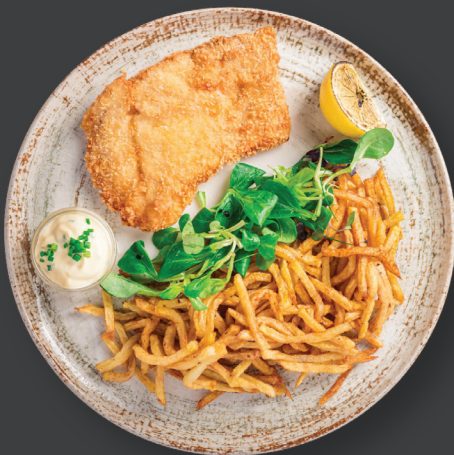
BREADED PIKE PERCH FILLET** with alloli sauce and French fries